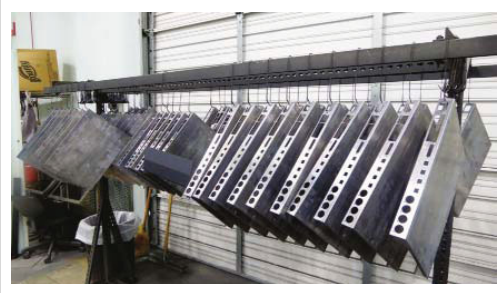
Rack mountable Blades prior to silk screening

Wheatstone's emergence as a DSP provider was something of an accident following the development of the Audio Ecosystem in 2001, which required the company to create its own Bridge router. By integrating the DSP into the resultant D-8000 digital console, processing and limiting was available on all the individual channels. Consequently, radio control surfaces were then created to work with the Bridge router as was the D-9