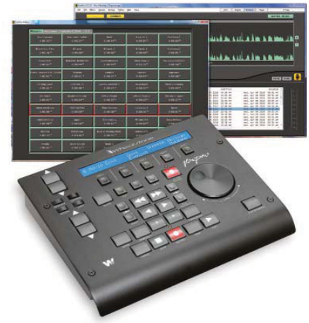
The real-time digital audio recorder editor VoxPro

The workflow journey of a product from parts to insertion undergoes constant appraisals made by Audio Precision testing